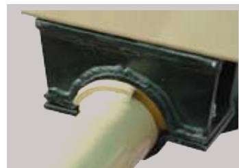
Replaceable nylon bearings on wheel mounts