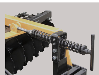
Self leveling spring cushioned with hand crank